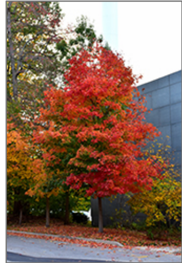
Fall Fiesta Sugar Maple in fall