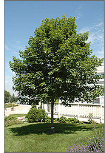
Fall Fiesta Sugar Maple

This tree should only be grown in full sunlight. It prefers to grow in average to moist conditions, and shouldn't be allowed to dry out. It is not particular as to soil pH, but grows best in rich soils. It is somewhat tolerant of urban pollution. This is a selection of a native North American species.