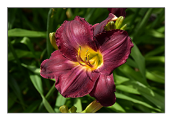
Rainbow Rhythm Nosferatu Daylily flowers

This is a relatively low maintenance plant, and is best cleaned up in early spring before it resumes active growth for the season. It is a good choice for attracting butterflies to your yard. It has no significant negative characteristics.