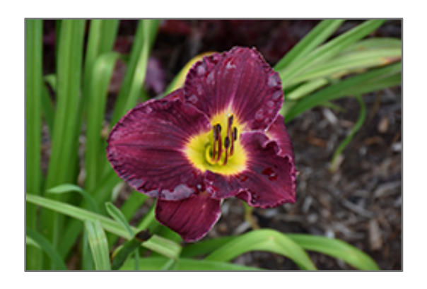
Rainbow Rhythm Nosferatu Daylily flowers

Rainbow Rhythm Nosferatu Daylily is an herbaceous perennial with a shapely form and gracefully arching foliage. Its medium texture blends into the garden, but can always be balanced by a couple of finer or coarser plants for an effective composition.