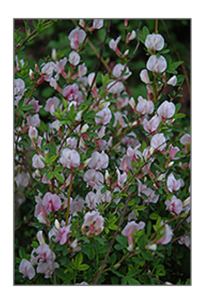
Purple Broom flowers

This is a high maintenance shrub that will require regular care and upkeep, and should only be pruned after flowering to avoid removing any of the current season's flowers. It has no significant negative characteristics.