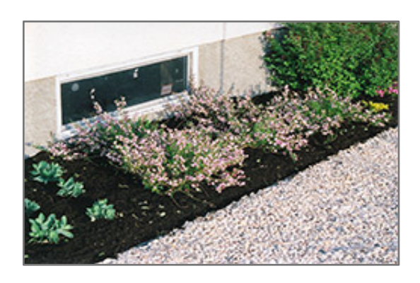
Purple Broom in bloom

Purple Broom is recommended for the following landscape applications;