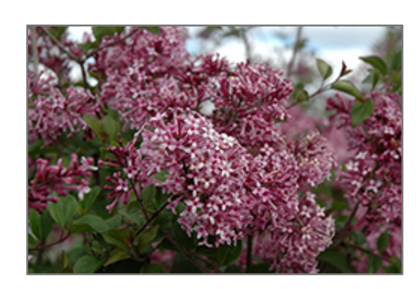
Bloomerang Purple Lilac flowers

A dwarf hybrid lilac that's just the right size for the garden, producing a plethora of sweetly fragrant lavender-purple flowers in late spring; reblooms constantly throughout the summer showing color until fall