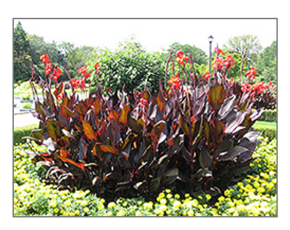
Red King Humbert Canna in bloom