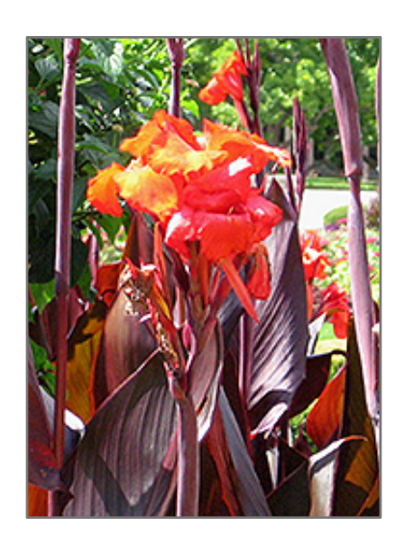
Red King Humbert Canna flowers

This plant is native to the tropics and prefers growing in moist environments with evenly warm conditions all year round. In our climate, it is usually grown as an outdoor annual in the garden or in a container. If you want it to survive the winter, it can be brought in to the house and provided with special care, and then returned to the garden the following season. In its preferred tropical habitat, it can grow to be around 6 feet tall at maturity extending to 8 feet tall with the flowers, with a spread of 4 feet. However, when grown as an annual or when overwintered indoors, it can be expected to perform differently, and its exact height and spread will depend on many factors; you may wish to consult with our experts as to how it might perform in your specific application and growing conditions.