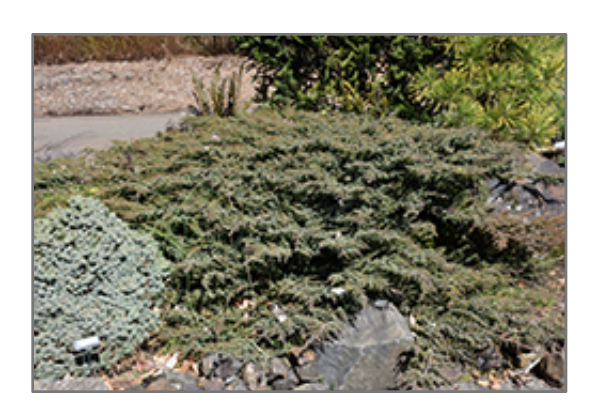
Green Carpet Juniper

Green Carpet Juniper is a dense multi-stemmed evergreen shrub with a ground-hugging habit of growth. It lends an extremely fine and delicate texture to the landscape composition which should be used to full effect.