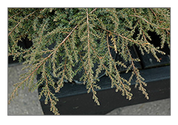
Green Carpet Juniper foliage

This is a relatively low maintenance shrub, and is best pruned in late winter once the threat of extreme cold has passed. It has no significant negative characteristics.