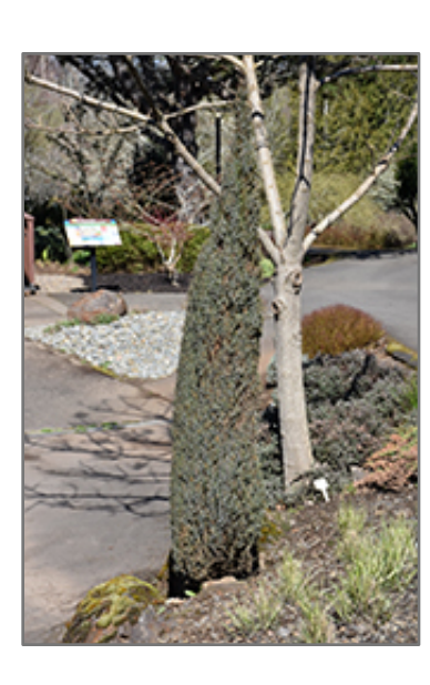
Compressa Juniper

Compressa Juniper is a dwarf conifer which is primarily valued in the landscape or garden for its rigidly columnar form. It has attractive dark green foliage with silver stripes. The needles are highly ornamental and turn coppery-bronze in the fall, which persists throughout the winter.