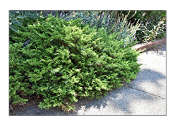
Buffalo Juniper

A common groundcover evergreen for home landscape and garden use; consistent bright green foliage all season long, low growing, wide spreading and densely branched, forms a mound; excellent in massing and groupings or as a groundcover