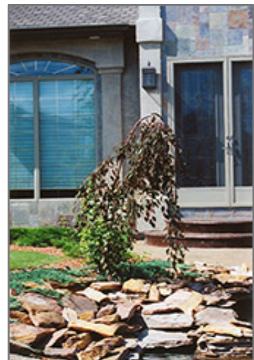
Royal Beauty Flowering Crab