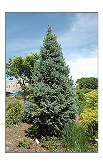
Upright Colorado Spruce