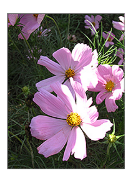
Sonata Pink Cosmos flowers