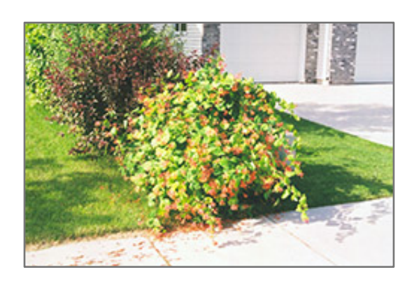
Mandarin Trumpet Honeysuckle in bloom

This is a relatively low maintenance woody vine, and is best pruned in late winter once the threat of extreme cold has passed. It is a good choice for attracting butterflies and hummingbirds to your yard. It has no significant negative characteristics.