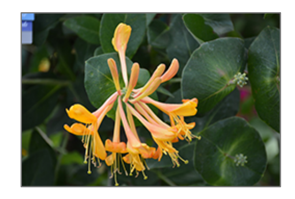
Mandarin Trumpet Honeysuckle flowers

Mandarin Trumpet Honeysuckle is a multi-stemmed deciduous woody vine with a twining and trailing habit of growth. Its relatively coarse texture can be used to stand it apart from other landscape plants with finer foliage.