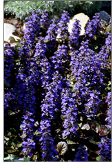
Mahogany Bugleweed flowers