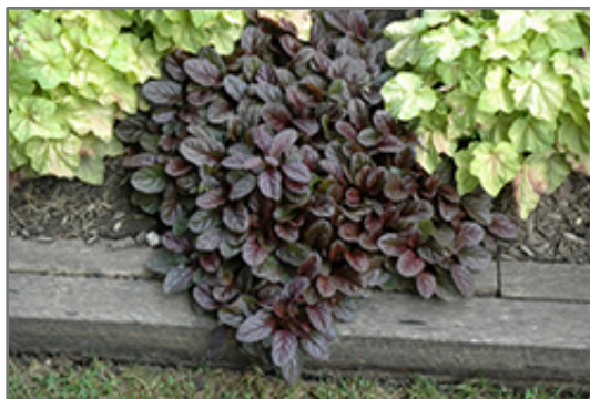
Mahogany Bugleweed