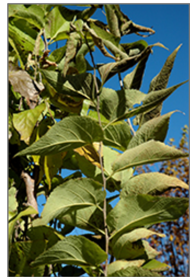
Prairie Sentinel Hackberry foliage