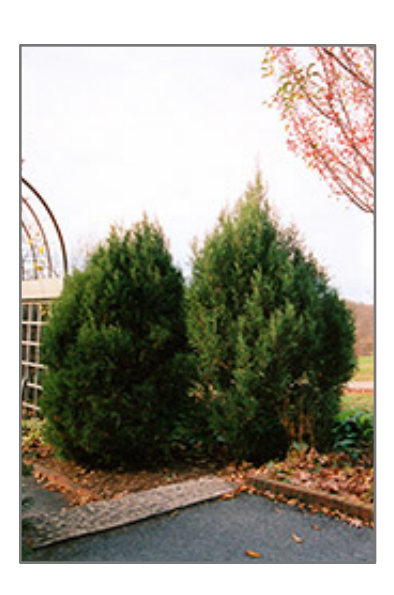
Cologreen Juniper

A dense and narrowly columnar evergreen shrub with soft textured silvery-gray needle-like foliage and abundant showy blue berries, a good compact choice for varying the skyline in difficult landscape situations, makes a great tall evergreen hedge