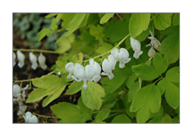
White Gold Bleeding Heart flowers

A vigorous variety with delicate and pedulous clusters of pure white flowers in late spring, over ferny golden foliage that is delicate and finely cut; an outstanding garden accent