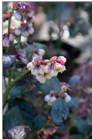
Pink Icing Blueberry flowers

This plant is not reliably hardy in our region, and certain restrictions may apply; contact the store for more information.