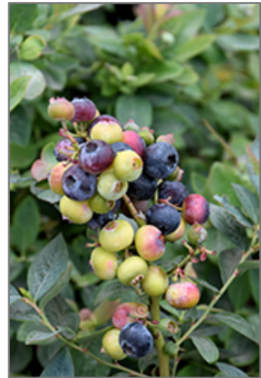
Pink Icing Blueberry fruit

Pink Icing Blueberry features dainty clusters of white bell-shaped flowers with shell pink overtones hanging below the branches in mid spring, which emerge from distinctive pink flower buds. It has bluish-green deciduous foliage which emerges pink in spring. The glossy oval leaves turn an outstanding aqua bluish-green in the fall. It features an abundance of magnificent blue berries in mid summer.