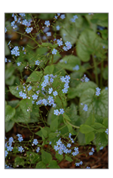
Alexander's Great Bugloss flowers

Large, attractive heart shaped leaves are silver with green veins; pretty blue flowers in spring; makes a nice accent in containers and lightens up shade gardens; avoid hot afternoon sun