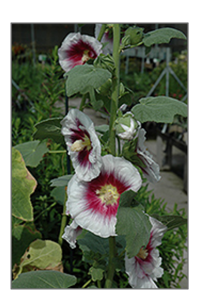
Creme de Cassis Hollyhock