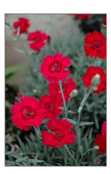
Red Beauty Pinks flowers

An eye catching garden accent, this variety blooms early in the season; silvery gray-green leaves and stems compliment the amazing lacey edged red blooms; an excellent choice for rock gardens and edging