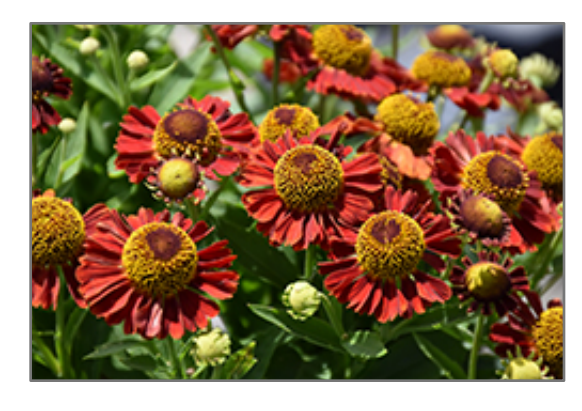
Mariachi Salsa Sneezeweed flowers

A great fall bloomer that brightens the garden with its rich red and orange flowers when everything else starts to fade; adapts to most soils; regular watering needed