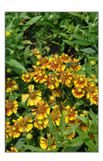
Western Mixture Sneezeweed flowers