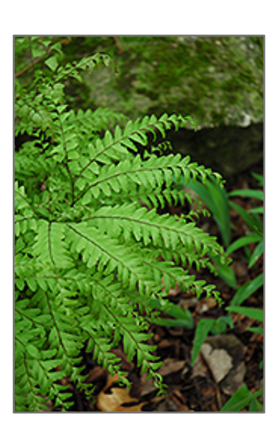
Northern Maidenhair Fern foliage

Northern Maidenhair Fern is primarily valued in the garden for its cascading habit of growth. Its crinkled ferny compound leaves are light green in colour. As an added bonus, the foliage turns a gorgeous gold in the fall. The black stems are very colorful and add to the overall interest of the plant.