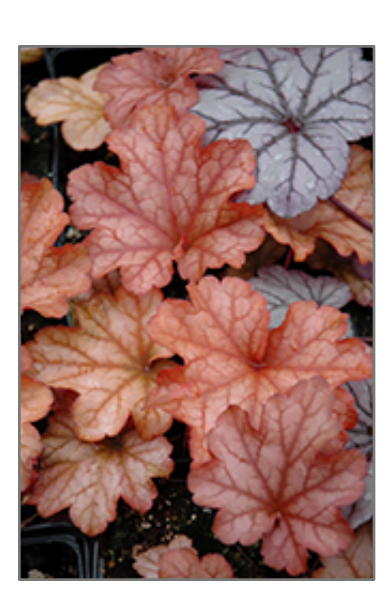
Paprika Coral Bells foliage

Heavily ruffled foliage develops stunning hues of orange, peach, coral and pale yellow; spikes of ivory bells in late spring to early summer; amazing contrast to other plants; great versatility; keep soil moist in heat of summer