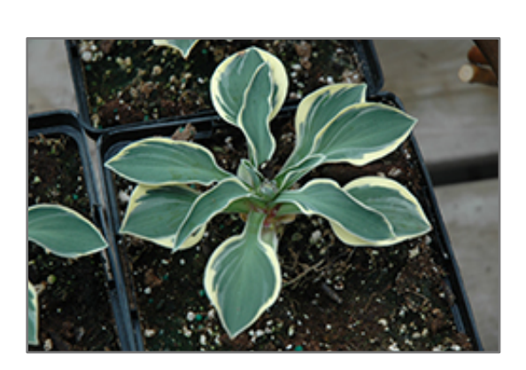
Funny Mouse Hosta foliage

This miniature mounded hosta features small round, blue-green leaves with white margins that eventually mature to cream or green; dainty spikes of pale lavender flowers in mid-summer; great for containers or edging