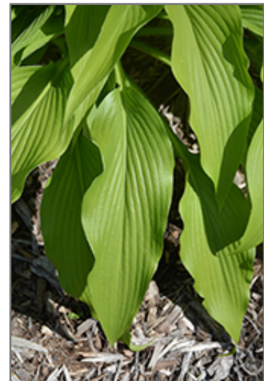
Jade Cascade Hosta foliage