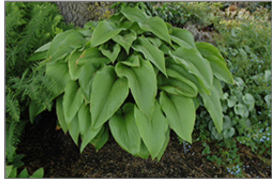
Jade Cascade Hosta

Jade Cascade Hosta is recommended for the following landscape applications;