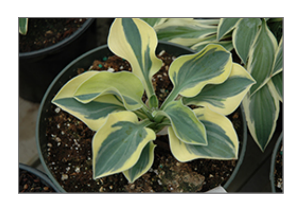
Lucky Mouse Hosta foliage

This miniature mounded hosta features small oval blue-green leaves with creamy-yellow margins; dainty spikes of pale lavender flowers in mid-summer; great for containers or edging