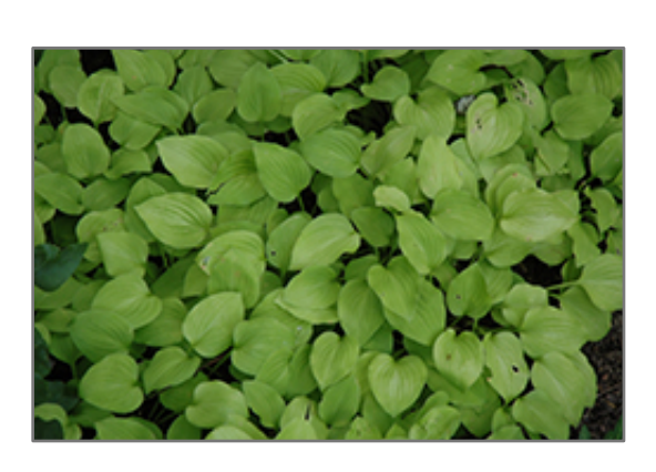
Sea Fire Hosta foliage

Emerging leaves are brilliant yellow-gold and mature to medium green by mid-summer; leaves are corrugated and twisted; spikes of lavender flowers in mid-summer; very eye catching in the spring and early summer