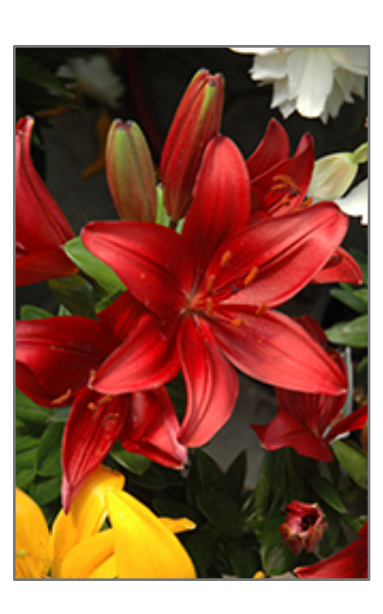
Lily Looks Tiny Dragon Lily flowers

This variety is a compact lily that bears well formed, upward facing, brilliant red blooms; perfect for containers or massing along borders; it is also known to have multiple blooms per stem