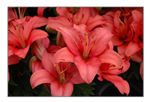
Lily Looks Tiny Robin Lily flowers