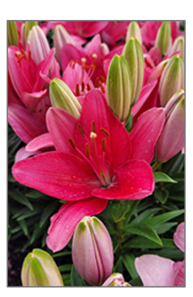
Lily Looks Tiny Toons Lily flowers

This variety is a compact lily that bears well formed, upward facing, deep pink blooms with orange centers; perfect for containers or massing along borders; it is also known to have multiple blooms per stem