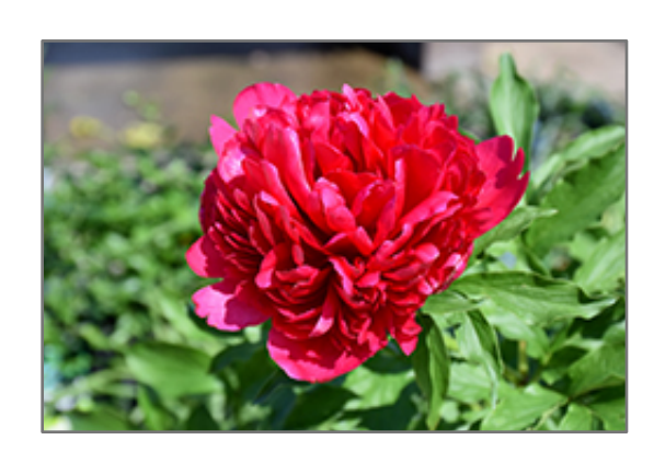
Many Happy Returns Peony flowers

A stunning, gold medal winner presenting sphere shaped, fully double blooms in vibrant red; long lasting flowers on sturdy stems; great for borders or mass planting; an excellent cut flower