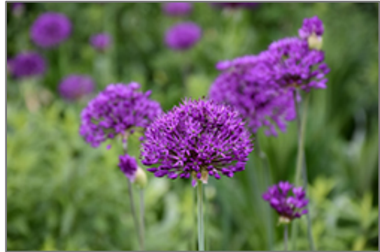
Purple Sensation Ornamental Onion flowers

Purple Sensation Ornamental Onion is an open herbaceous perennial with tall flower stalks held atop a low mound of foliage. Its relatively coarse texture can be used to stand it apart from other garden plants with finer foliage.