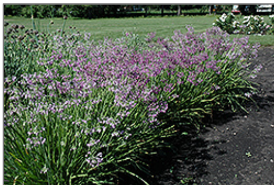
Nodding Onion in bloom