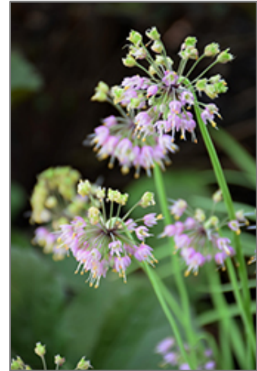
Nodding Onion flowers

This plant should only be grown in full sunlight. It does best in average to evenly moist conditions, but will not tolerate standing water. It is not particular as to soil type or pH, and is able to handle environmental salt. It is highly tolerant of urban pollution and will even thrive in inner city environments. This species is native to parts of North America. It can be propagated by multiplication of the underground bulbs.