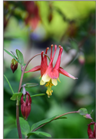
Wild Red Columbine flowers