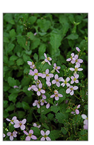
Pink Wall Cress flowers

A low mounded and compact selection that features deep green foliage and pretty pink blooms during the spring and into early summer; drought tolerant and low maintenance, deadhead spent flowers; excellent performance in borders and rock gardens