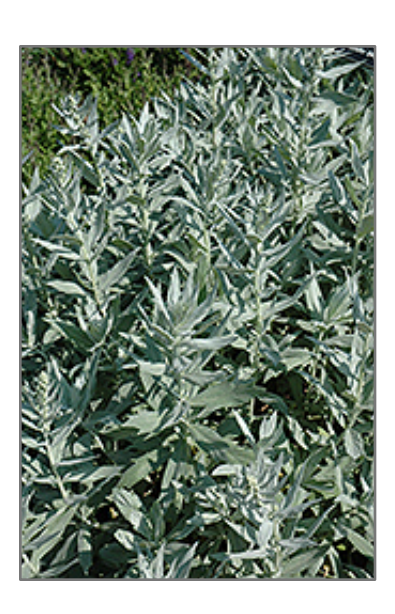
White Mugwort foliage