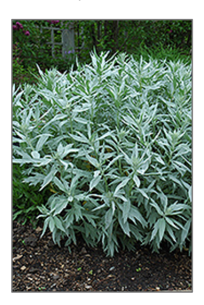
White Mugwort