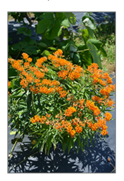
Butterfly Weed in bloom