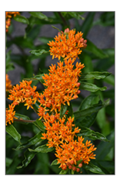
Butterfly Weed flowers