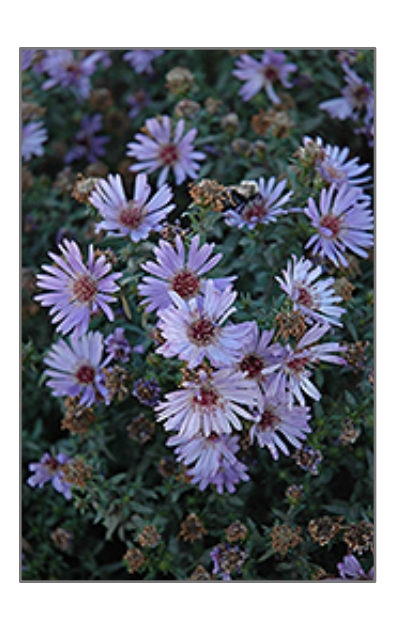
Woods Blue Aster flowers