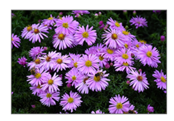
Woods Pink Aster flowers

Mounds of narrow, dark green foliage are covered with pink daisy-like flowers, adding a pop of color to autumn days; dwarf compact habit, ideal for patio containers, borders or garden beds; beautiful added to fresh cut arrangements; low maintenance