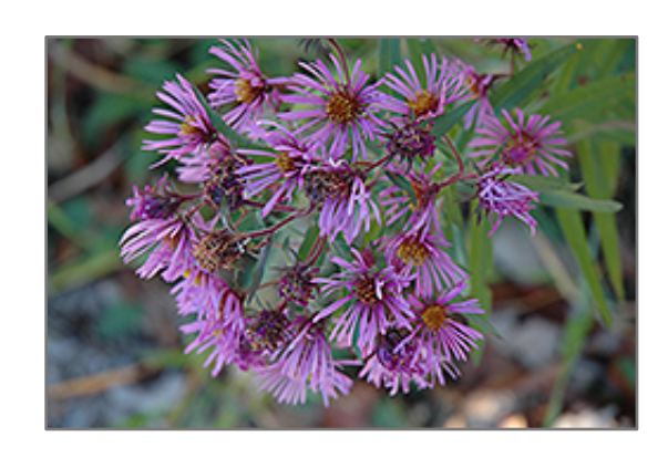
New England Aster flowers

This compact mounded selection is a stunner during the late summer months and into the fall; bubblegum pink flowers with yellow centers bloom among dark green foliage; beautiful in borders or fresh cut arrangements