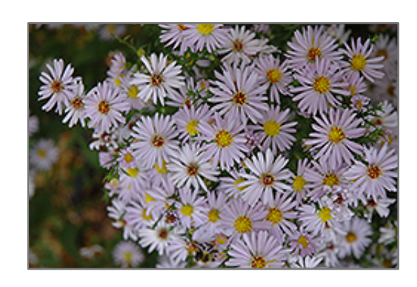
Porzellan Aster flowers

A profusion of lavender flowers and attractive lance-like green leaves; prefers cool, moist soil; water regularly from the root zone instead of from the top to reduce fungal disease, and to encourage more blooms