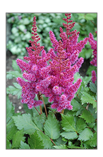
Visions Astilbe flowers

A low maintenance, shade loving variety, featuring tall, upright plants; cherry-red plumes rise above mounds of ferny, toothed foliage; an excellent addition to shaded gardens, borders, containers or fresh-cut bouquets; low maintenance