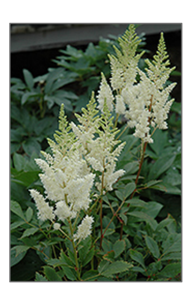
White Gloria Astilbe flowers

This early summer bloomer produces tall stems of creamy white plumes that stand out in shaded gardens, borders or containers; vigorous upright habit with low mounding deep green foliage; easy to grow, requiring little to no maintenance