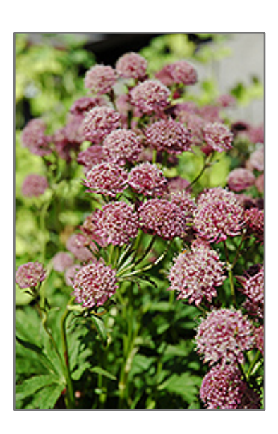
Hadspen Blood Masterwort flowers

A lovely selection that produces tall stems of ruby red pincushion flowers; upright selection featuring dark green, ferny foliage during the summer months; self-seeding, requiring some maintenance and pruning in the fall