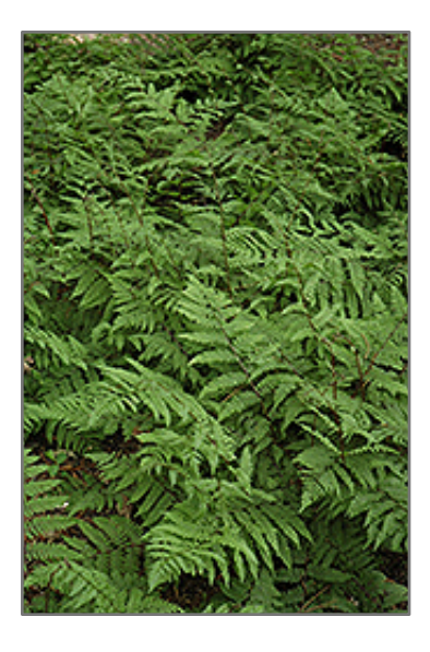
Lady Fern foliage