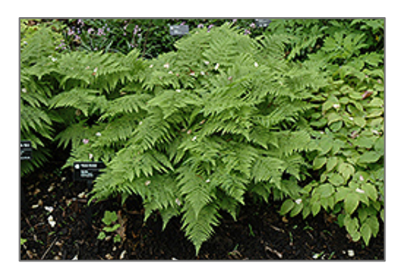
Lady Fern