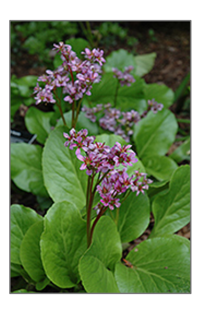
Purpleleaf Bergenia flowers