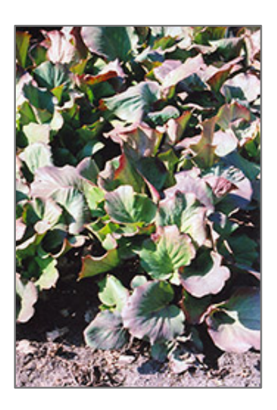
Purpleleaf Bergenia foliage