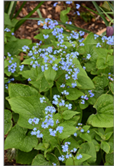
Siberian Bugloss flowers