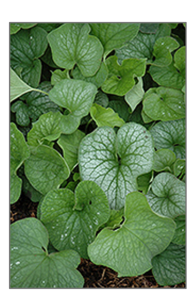
Langtrees Bugloss foliage

Shade loving and easy to grow, this variety features dark green heart shaped leaves with interesting silver spots dotting the edges; sky blue flowers emerge during the late spring months; low maintenance