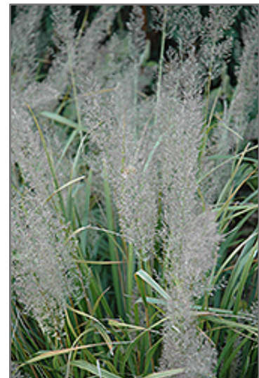
Korean Reed Grass fruit